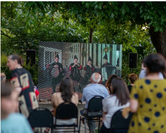
19 June, 2021, Public presentation of the project results at the Upper Bethlemi Church Terrace in Old Tbilisi

Awareness raising on the role of living heritage safeguarding in our contemporary societies through a series of public meetings and presentations.