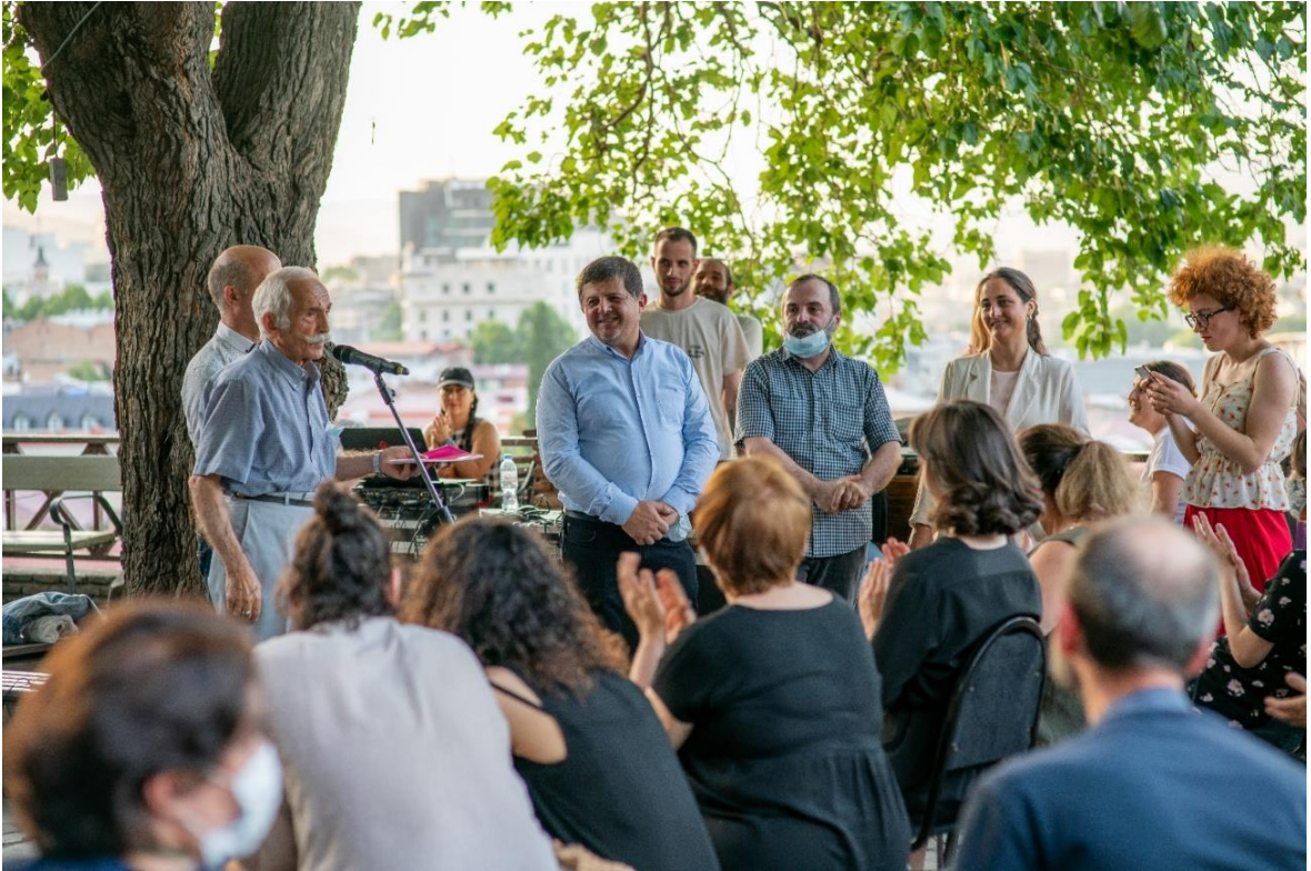
19 June, 2021, Public presentation of the project results at the Upper Bethlemi Church Terrace in Old Tbilisi