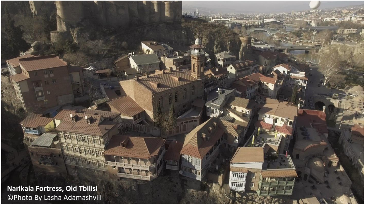
Narikala Fortress, Old Tbilisi

Tbilisi has evolved over the millennia as a vibrant multi-ethnic city, which has been a cultural and economic centre of the entire Caucasus for centuries. The city flourished notably in the 19th century, when it became the hub of craftsmanship and trade, where local marketplaces - the bazaars - brought together an astonishing range of producers and service providers. They ranged from hairdressers and bakers to musicians and bands performing usually during weddings and festivals, as well as water- and wine-sack carriers and sulphur bath scrubbers. Here, craft workshops ensured the transmission of the skills and knowledge for producing and selling the plethora of traditional handmade goods. The vendors offered their customers clothes, shoes, various types of textiles, rugs & carpets, ceramic tableware, as well as gold-, silver-, stone- or wood works.